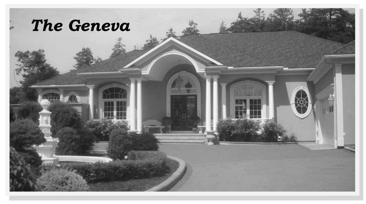
Included Features: Stucco or Stone Front, Vinyl Sides and Rear